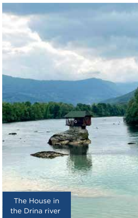
The House in the Drina river

The tour begins with a scenic 2.5-hour drive to Western Serbia, renowned for its untouched nature, delicious cuisine, and warm hospitality. The first stop is "Kapija Podrinja," a breathtaking viewpoint offering stunning views of the Drina River and surrounding mountains.